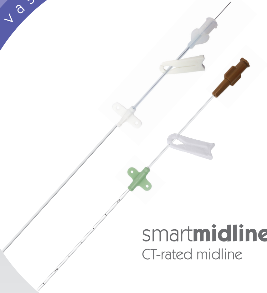
smartmidline™ CT-rated midline