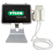
vysion XS Ultrasound System Code U-Lite