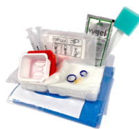
VYSET insertion Sets Codes V02771713 (basic), V02771714 (complete), V02771818 (max. barrier)