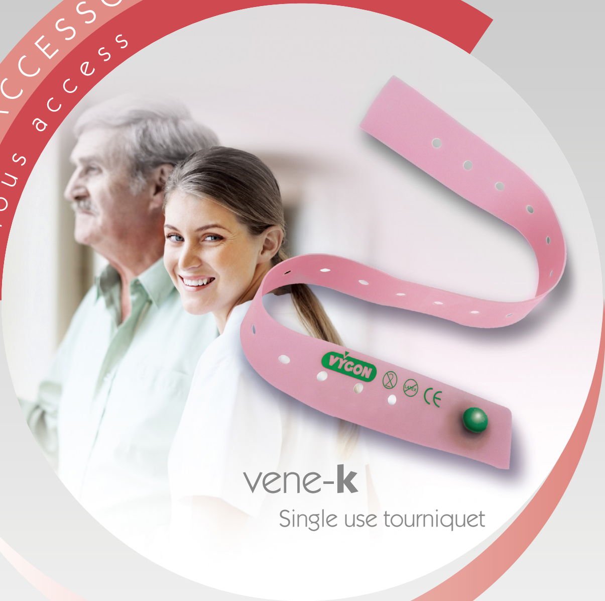
vene-k Single use tourniquet