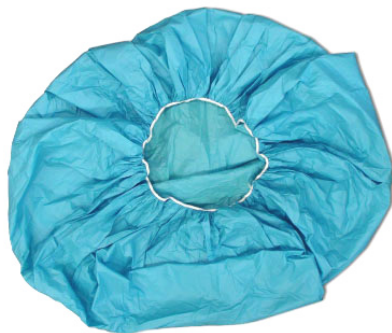
Birthing ball protective cover