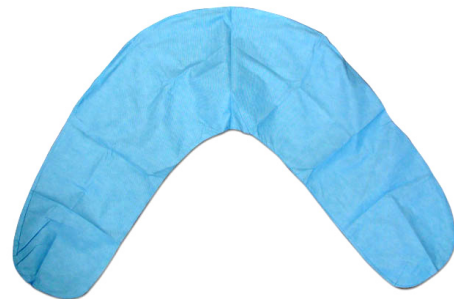
Positioning pillow protective cover